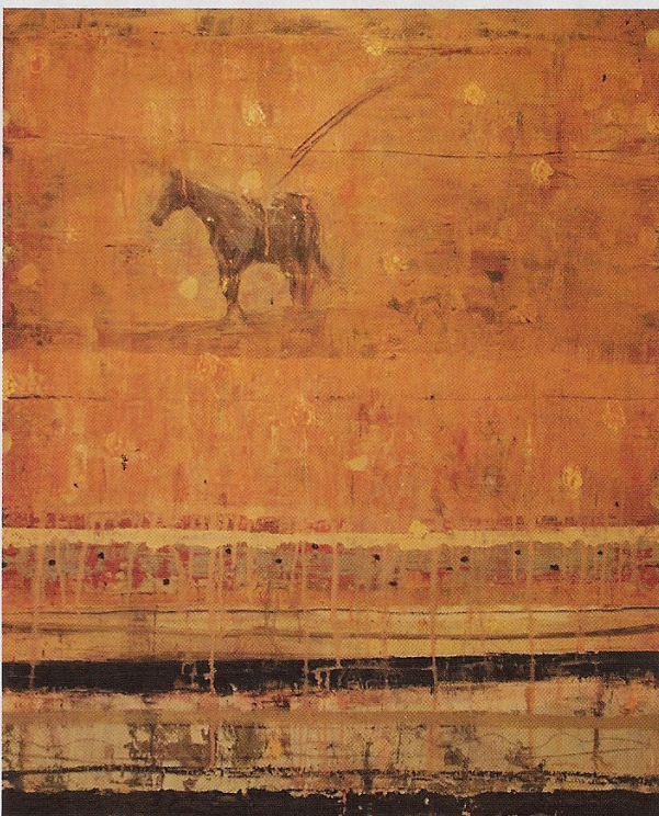
▲ SOLO, OIL/ALKYD/PENCIL, 35 X 29.